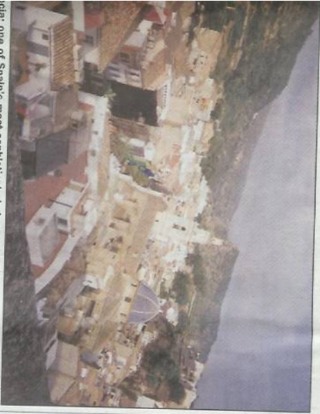
Valencia, one of Spain's most sophisticated places, to live

points out that property city itself and its surrounding villages built on "urban land are not affected. Here, Spanish speaker, has lived in Valencia for 25 years. He and his Valencian friend founded their own estate company, Spain & Property, two years ago. "There are properties for sale in all budgets in Valencia and the surrounding towns and villages such as Montroy, L'Elhiana and Riba